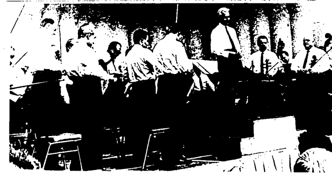
BAROQUE ORCHESTRA and Director Jean Martinon take a bow after all-Bach Fair Lane Festival Concert.