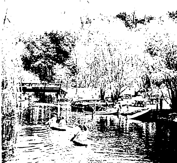
CANOEISTS, PICNICKERS LIKE PROUD LAKE RECREATION AREA