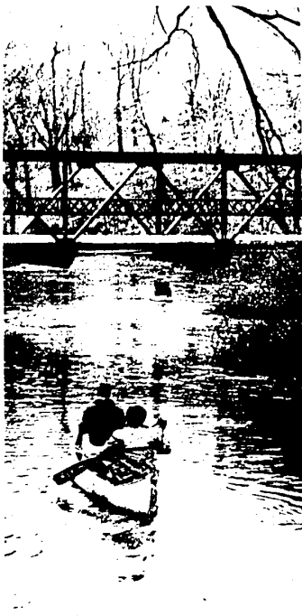
ACADEMY ROAD BRIDGE — LANDING SPOT