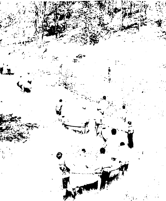
ENTIRE GROUPS FIND CANOEING AN EXCELLENT OUTDOOR ACTIVITY