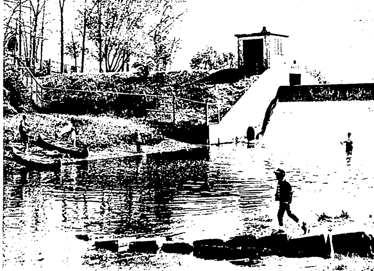
STARTING POINT: BELOW KENT LAKE DAM