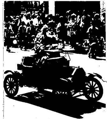
THE FESTIVAL PARADE has everything — even clowns. This year's parade will form at 10 a.m. Saturday, July 29, and proceed west on Grand River from the Grand River Drive-In to Farmington Rd. The speakers stand will be located on Grand River just east of the Downtown Center.