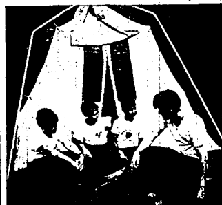
OVERNIGHT CAMPOUT preparations are made by members of the Livonia Family & Pioneer Day Camp for a trip to Kensington Park. Four more weeks of Pioneer Day Camp remain. Call the YMCA for information and registration (261-0378).