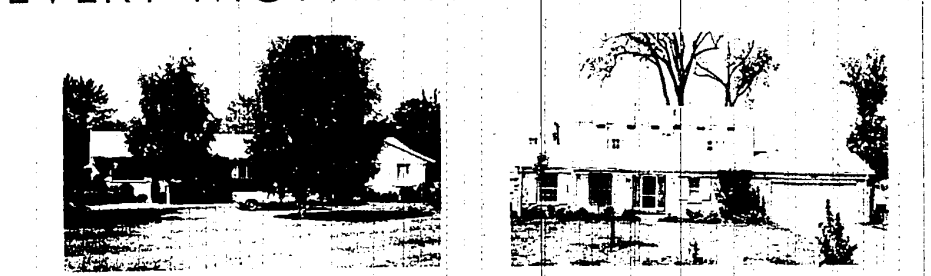
SOUTHFIELD - SAN MARINO VILLAS - 3 Bedroom 2 bath custom built ranch. Modern kitchen plus 13'x12' country-style breakfast room with barbecue, family room, paneled dining room with natural fireplace, full basement, central air conditioning, huge beautiful lot. Immediate occupancy. $44,900.