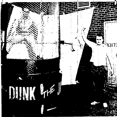
AN UNIDENTIFIED JAYCEE waits to get wet in the Jaycee's Dunk, the Jaycee concession set up in the Downtown Center parking lot. He doesn't look too perturbed about the fate awaiting him. Nobody knows just how many Jaycees took a bousing during the Festival, but the wet weather forced the group to cancel its barbecue on Saturday. Refunds will be made on advance sale tickets if holders will send the tickets to Box 33, Farmington, with their name and address, or by contacting any Jaycee.