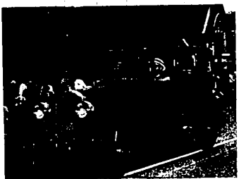
VINTAGE CARS are always show-stoppers. This well-polished model got its share of attention from spectators along the parade route on Grand River.