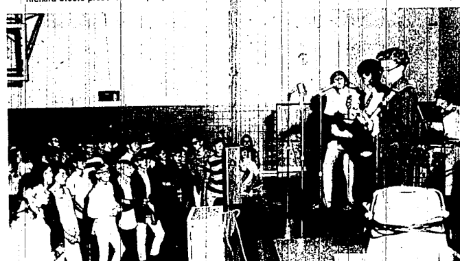
EAST JUNIOR HIGH SCHOOL rocked with the beat of young feet belonging to the kids who attended FATA's dance for teenagers during the Festival. This combo held its audience enthralled, by the looks of it.