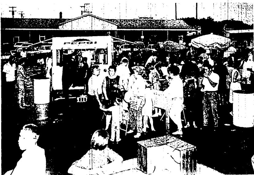
WET WEATHER didn't keep the Festival crowds at home. This scene in Downtown Center just after a rain storm shows them happily munching corn, eating pop corn, sipping soft drinks and just having a good time visiting with old friends.