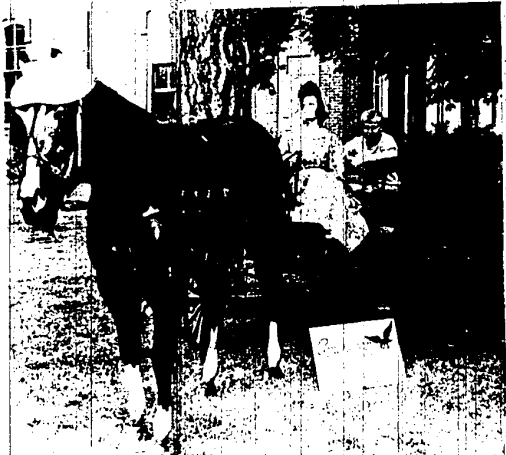
JIM CLEMENTS , of Hollyhill Drive, in the back seat of this old time carriage, is the only modern note in the picture. The carriage was parked on the lawn of the Village Green during the Festival and looked right in place.