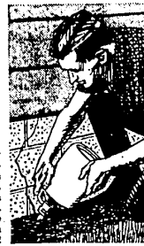
Sears Paint Dept.

Seals below-ground, masonry cracks without extensive digging. Just scoop out a six-inch hole above the cracked area. Soak with a hose, then pour in liquid Gold Bond Hydro-Stop. It follows the water right to the crack and seals it upon drying. That's all there is to it!