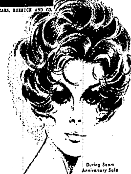
During Sears Anniversary Sale