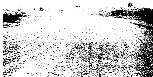
AN IMPROVEMENT --The county has been working on the widening and paving of Drake Rd. north of Grand River during the summer. This project, which had earmarked funds, is being financed by the county, the township, and Thompson Brown Company which is developing a new subdivision in the area.