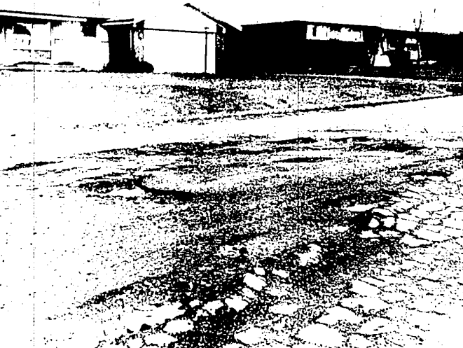
BROKEN PAVING --On Brandywine in the Kendallwood Subdivision the paving has broken. The holes create problems for the motorists, but do slow down traffic on the street.