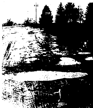
ASSURING A STOP --The holes in Drake Rd. just south of 12 Mile assure that no motorist will run the stop sign at the intersection.