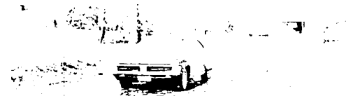
CHUCK HOLES --That's the best way to describe Highmeadow in the Holly Hill Farms Subdivision.