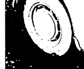
DEEP DOWN --At Hearstone and Farmington Rd. a wheel drops deep into a hole in the pavement.