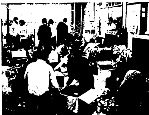
A COLLECTION POINT—That was the situation in the lobby of North Farmington High School when the students brought the results of the Christmas Food collection to school. More than 6,000 items were brought in by the students who combed their neighborhoods for donations. The goods were turned over to the Farmington Goodfellows for distribution.