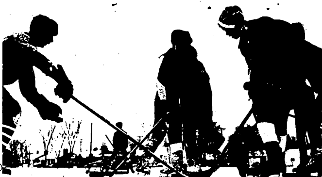
HOCKEY IS DRAWING young men to patches of any size. This group was silhouetted by chief

this area for sledding, kept it clear of obstructions and provided bales of hay along the edges so that sledders won't crash into trees and bushes.