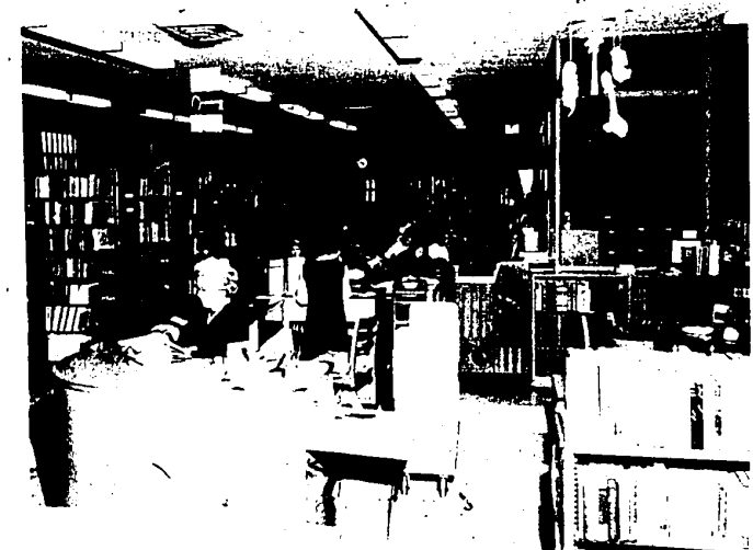
CROWDED FACILITIES—Voters approved additional millage for library expansion during 1967. A new Farmington District Library will be constructed at 12 Mile and Farmington Rd., and the existing library in the city will be expanded.