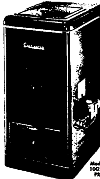
Model 1005K PR

Metallic silicone enamel finish, bright stainless steel trim. Electrically welded special corrugated alloy steel combustion chamber, featuring secondary fire brick lining, will not crack, warp, or absorb grease, liquids, fats, or juices. Exclusive twin cyclonic built-in smoke, odor and fly ash eliminator — featuring no burners to become plugged or moving parts to wear out.