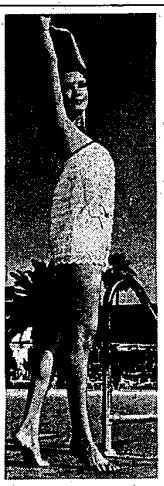
FOR THE SHY girl who wants to wear a bikini, there's always this white eyelet chemise that can be worn as a cover-up outside the brief two-piece suit.