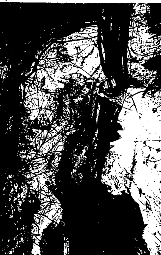
TO BE PROTECTED—This is the view of Johnson Drain from Napier Rd. in Plymouth Township. The state Water Resources Commission, Conservation director and sportsmen agree it should be protected as a trout water.