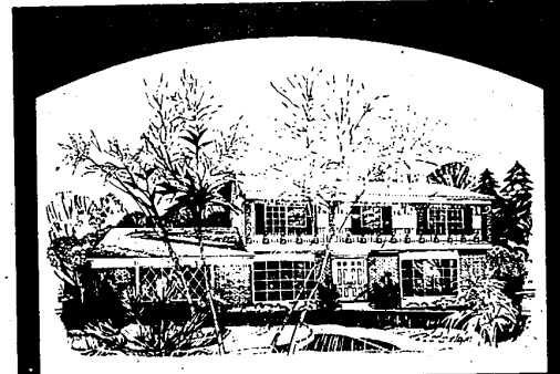
Your Lot ... Our House

The models are located in Hatherly Village on Fifteen Mile Road between Ryan and Mound. Open 10 A.M. to 6 P.M. each day. Sundays from noon. Prices range from $35,000 to $80,000. Phone 284-0500