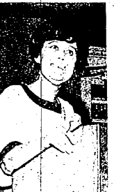
"My theory about boys' bedrooms is that if you use enough incense, you can hold your own with the board of health."