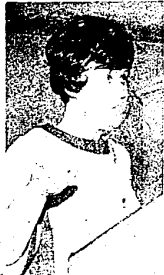
My children don't read the column. It's on the editorial page.