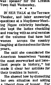
"My neighbors don't seem to recognize themselves."