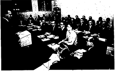
Typical Classroom Scene

that Michigan people have made our classes successful. When we opened the Michigan Institute we knew the people would be interested in personal improvement in the specific direction of reading skills. The success of the classes proved this. In addition, we are pleased with the pre-registration enrollment for future classes. As part of Reading Dynamics I can assure you that we will endeavor to earn a proud position in the community and that we are obligated to those who have taken our course and to those who will take it.