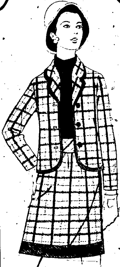
misses' dirndl-skirted 3-piece plaid suit

The hottest looks of the season precisely tailored in 2 size ranges . . . priced to fit your budget!