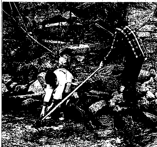
CATCH AS CATCH CAN —Reaching with their rakes to pull in whatever they can hook are these young volunteers in "Operation Clean-up," helping nature trail preparations in City Park.