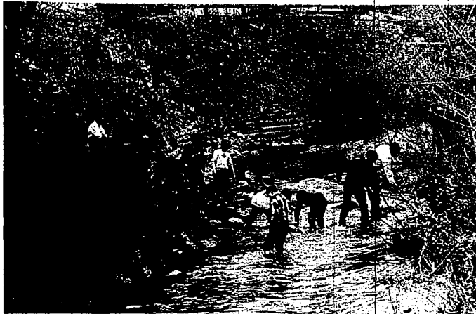
DOING A GOOD TURN FOR FARMINGTON —Foot by foot, Farmington Boy Scouts last weekend challenged the Rouge River to yield its accumulation of discarded debris as they systematically devoted the first of three sessions to cleaning the river.