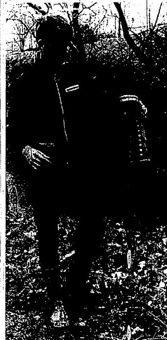
BY THE BOOTFUL —This is one Boy Scout who stepped into more than he bargained for when he joined his mates in the river cleaning job last weekend. As the photographer observed, "Fourteen inches of boots weren't quite enough to wade in 15 inches of water."