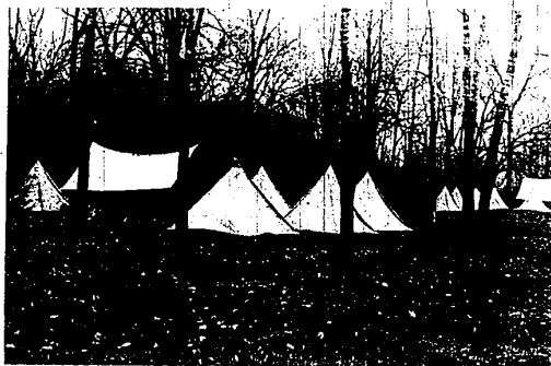
A CAMPING WE WILL GO —Scouts involved in the initial phase of cleaning debris from the Rouge River in Farmington came prepared to stay until they completed their assignment, as evidenced by this row of tents which they set up at City Park headquarters.