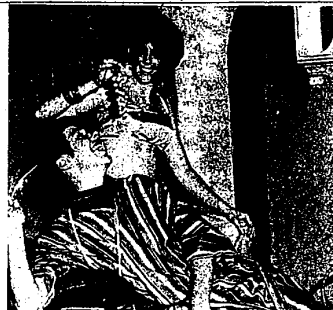
ORIENTAL SLENDOR —Not many American lads have the chance to be hand-fed grapes by a beautiful maiden, but this youth is only playing his part for North Farmington High's production of "Kismet." The musical play will be given in the school at 8 p.m. May 10-11 and May 17-18.