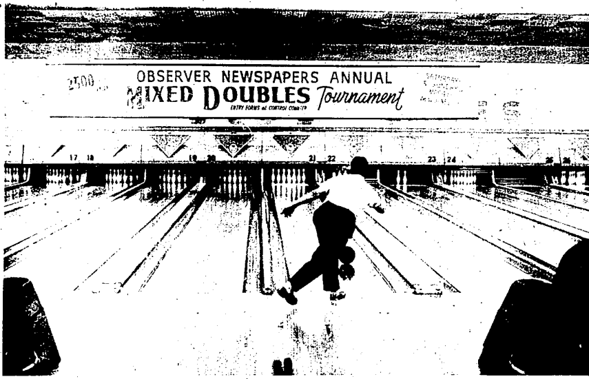
Bowler fires a practice ball under sign telling of the fifth annual Observer Newspapers-Merri-Bowl Lanes Mixed Doubles Tourney.

Under the tournament rules, 18 games constitutes a league average which must be attested to by the league secretary or city association secretary. Bowlers in the area governed by the Detroit Bowling Association and the Detroit Women's Bowling Association must have certificates from those associations.