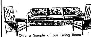
Only a Sample of our Living Room Values are these Hi-back Tufted Italian Chairs in velvet fabrics, decorator colors, NOW $99 each. 86-inch skirted Sofa with pillow backs and seats, NOW $249.