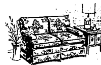
54" Sofa Starting at $289.