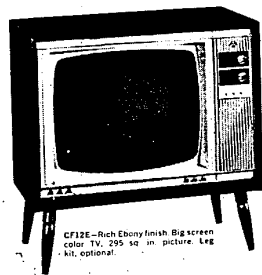
CF12E—Rich Ebony finish. Big screen color TV, 295 sq. in. picture. Leg kit, optional.

No other Color TV set at any price has a brighter picture than Sylvania.