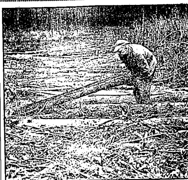
CORDUROY ROAD —Ray Parker of Wayland, Mich., is proving that corduroy roads still have their place in the rural scene by building one. Equipped with modern tools, Parker is constructing an 1800-foot road through a swamp to serve his resort on Gun Lake. He cuts logs, knits them together over a base of small brush, adds a top layer of poles and covers it all with gravel.

Baloo rye is steadily gaining in favor as the earliest spring and the latest fall cow pasture. Thirty-five out of 41 DRAI westerns recently reported that many of their members are using Baloo rye.