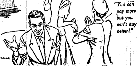
"You can pay more but you can't buy better!"