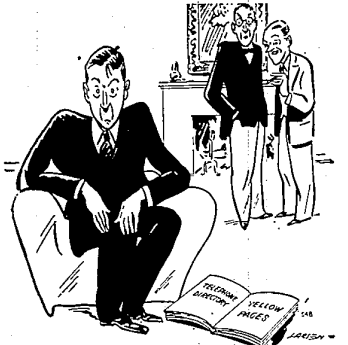
"Poor Albert! After building and furnishing a house with the help of the telephone directory Yellow Pages, he found there was no listing under 'Matrimonial Agencies!'"