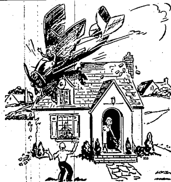
"Don't blow your top, mister. You can easily find a good roof in the telephone directory Yellow Pages."