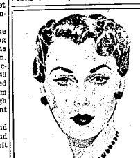
Jean's Beauty Salon Phone 0630 33342 GRAND RIVER AVENUE at FARMINGTON ROAD

The cabinet minister is best known in the United States as former Counselor of Embassy in Washington. As a roving foreign correspondent, he has traveled widely in Europe and Asia.