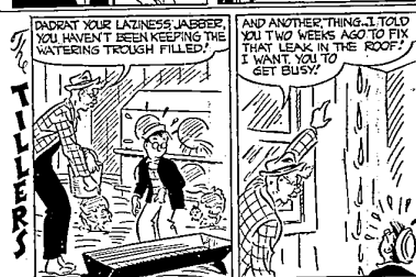
Ticklers By George