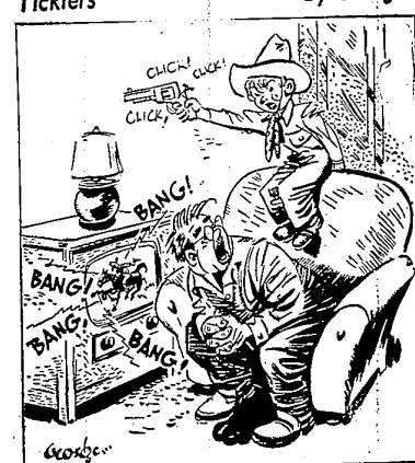
"How do you expect me to enjoy this Western with you making all that racket?"