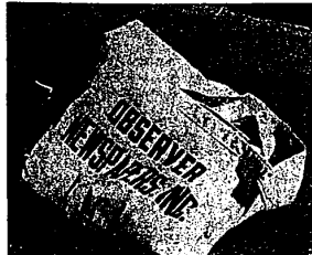
Bags like this one help win contests.

Pictured on this page are seven Observer carrier boys, one from each of the Observer Newspapers circulation areas.