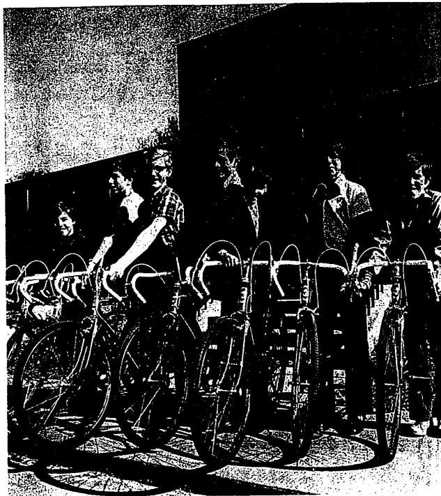
Big smiles tell the story...these are seven winners of bikes.

We congratulate these seven outstanding young men, whose business skill has benefited their customers and themselves.