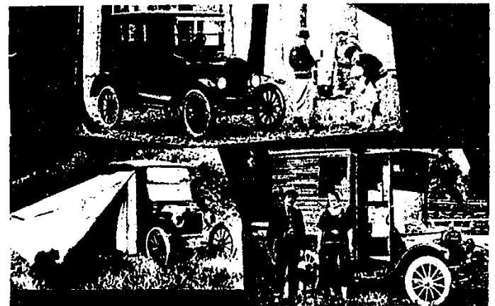
Early Recreational Vehicles

Camping trailers are often confused with travel trailers, motor homes with mini-homes, and so on.