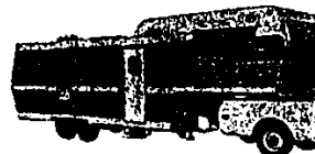
FRANKLIN "RANCH WAGON" 5th WHEEL TRAILER