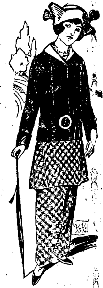
PLAID WITH CORDUROY. Such combinations as this promise to be well liked for the coming season.