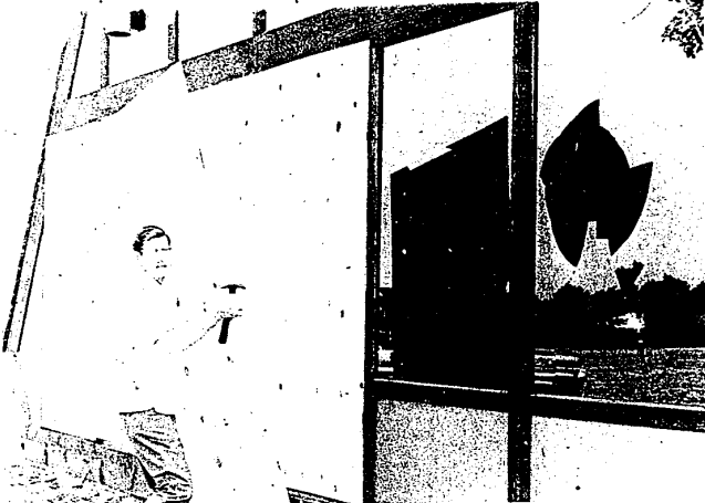
BROKEN PLANS -- Plans for the official opening of the YMCA located at 12 Mile and Farmington had to be postponed this week after vandals destroyed $3,000 worth of tinted, plate