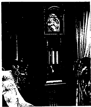
THE AMBASSADOR - This heirloom piece has burnished brass columns and brass inlays in the base. The natural beauty of the cherry case has rare Carpathian Elm Burl veneer overlays. It is finished in the Savannah finish. The middle case door is glazed with beveled and polished glass. It features a moving moon phase dial with raised Arabic numerals and a triple chime movement that plays Westminster, Whittington and St. Michael's chimes.