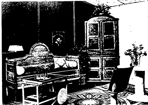
CORDUROY CLIMBS THE WALLS - Cotton corduroy in a neat geometric print adorns the wall behind an antique Finnish daybed in this unusual room setting. Seams of the fabric are covered by embroidered tape edged with balsa wood. The motif is carried out in a printed corduroy cover for the daybed and velvety no-wale corduroy pillows decorated with embroidered tape. An 18th century painted corner cupboard and contemporary Finnish chair and tables complete the decor.

One executed in pine would blend with early American because of its handsome Federal pediment; another has the soft curves of French provincial in cherry. The pediment and classic columns of the base of one crafted in oak and pecan hints strongly of Italian origins.