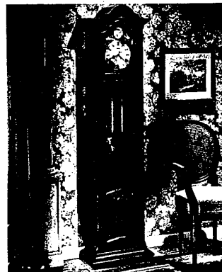
THE ORLEANS - from the graceful curve of the pediment to the hand carved detail this clock bespeaks it's French origins. It is accented with antiqued brass hardware and brass wire mesh. The case is Cherry finished in Sheridan.