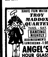
HAVE FUN WITH TROY MADDOX QUARTET DANCING NIGHTLY BUSINESSMEN'S LUNCHEONS 1-95 ANGEL'S HOUR GLASS 1820 W. LANSING AVE. 536-4430

VA and HUD during April commemorated the fourth anniversary of the U.S. Fair Housing Law (Title VIII, Civil Rights Act of 1968) by calling attention to progress made toward full implementation of the law.