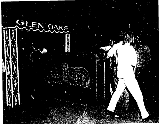
GAMBLING RAID -- Some of the gaming equipment is carried out of the country club by police officers.