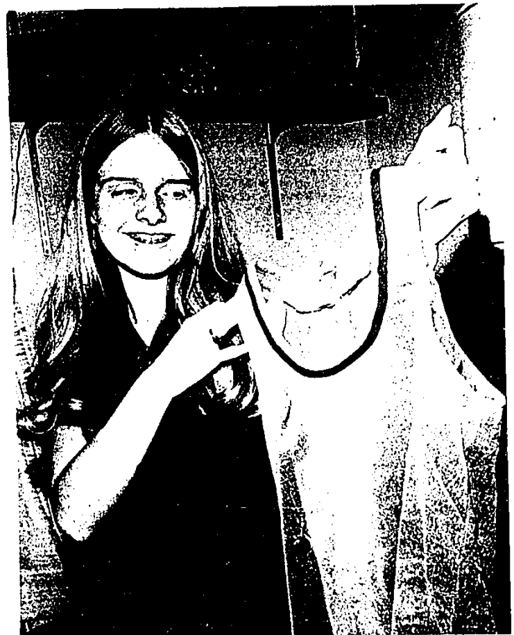
ONE FAVORITE is a light brown corduroy vest and pants with braid trim of deeper brown.