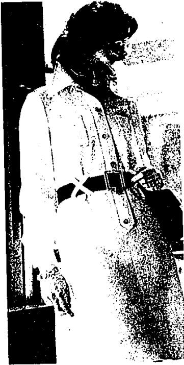
SHIRTTWAIST DRESS from Simplicity pattern 5151 is great in crepe, challis, lightweight wool. It's a How-To-Sew pattern.

Simple patterns have long been a part of the home sewing scene -- for use by beginners or when the project was a hurry-up one.