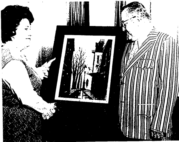
ART AUCTION -- The Rotary Club of Farmington will hold its second annual art auction Nov. 5 at the Copper Door, 8701 Inkster Road at Joy in Westland. A preview will be held at 7:30