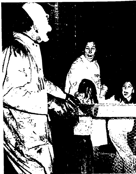
SCARY FUN -- A little girl's eyes widen and another covers her face as they go through the Farmington Jaycees' haunted house. Even mother seems startled. The house, located in the former YMCA branch at 35100 Grand River, is open from 6 p.m. to 10 p.m. on weekdays and from noon to 10 p.m. on weekends. It will be closed the night of Oct. 30. Admission is 35 cents.

An assessment district could be stopped by petitions filed within 45 days of the public hearing.