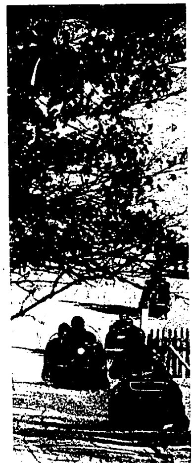
Snow trail ends.

26350 Grand River, Between Beech & Inkster 535-0600 DAILY 10-9 SAT. 10-5 SUN. 11-5 KE 5-0600