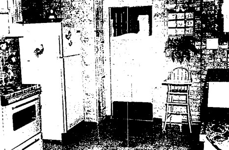
RED BRICK LOOK was achieved by using hardboard paneling on the walls. Black molding was used at floor, ceiling and room-entrance to set off the Masonite brand Plantation Red paneling. Conversion of the kitchen took approximately two weeks of spare time work for the young couple. Antiques were used to accent the room setting.

Apartment construction accounts for over fifty per cent of all housing starts, and is expected to increase even more within a few years. Some of the prime reasons behind the trend to multifamily buildings, according to Apartment Construction News, are: • The increasing cost of land • The declining birth rate • The rapid increase in the number of working wives • The desire for no-maintenance housing The planned recreational and social amenities offered by multi-family complexes. wood windows and panel or louver doors, are being used to accent the "character" of the overall design -- be it traditional or modern. Their use is feasible because ponderosa pine windows and both panel and louver doors are available in stock sizes and come in a variety of contemporary and traditional styles. Residents find them attractive, designers versatile, and builders more practical and less costly than custom units.