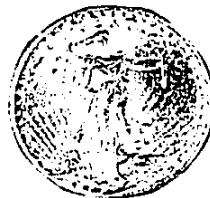
*20 SAINT GAUDENS