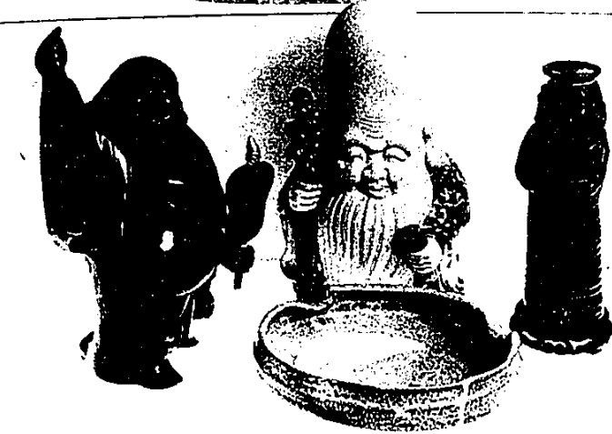
A serene Buddha smiles down on a laughing HO TAI fortune GOD. Centered amid beautiful Chinese art. Perfect for that unusual Christmas gift.