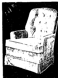
Swivel Rocker in Velvet Our regular 139.95

A Luxurious Chair -- the Perfect Gift for All The Family