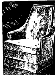
Accent Chair in Velvet Our regular 139.95