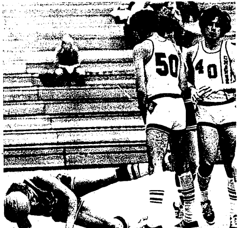
foul, Plymouth toppled Churchill in the first round of the Churchill tourney. 61-58.