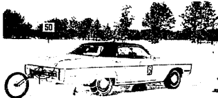
A test car brakes to a stop on glare ice during the National Safety Council's winter driving test program. Stopping ability of various types of tires, fire chains and other equipment are evaluated in the annual test program.