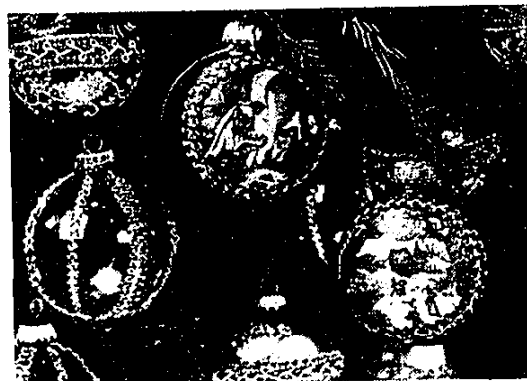
Hand-decorated bulbs revive old German art to add new beauty to holiday trees.

For those who feel they are not creative or lack the time to make their own decorations, stores are filled with many ready-made decorations for tree and home.