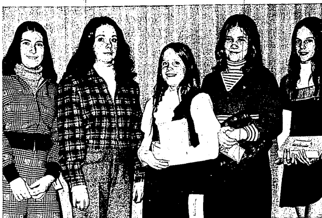
MAKE IT WITH WOOL contest representatives from two Farmington/4-H Clubs were from