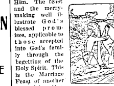
The Prodigal's Return.

Application of the Parable. How grandly this parable illustrates the lengths, breadths, heights and depths of the Love of God! The robe, shoes, etc., well represent God's provision through Christ for covering the imperfections of all who return to Him. The feast and the merry-making well illustrate God's blessed promises, applicable to those accepted into God's family through the begetting of the Holy Spirit. This is the Marriage Feast of another para-