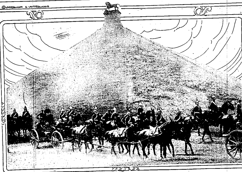
Where the battle of Waterloo was fought.

The Lion of Waterloo on its 200-foot mound is in the center of the famous battleground about ten miles outside the city of Brussels, Belgium. On this famous battlefield, which in 1815 54,000 men lost their lives and Napoleon went down to defeat, the allied forces of Europe may soon be engaged in the decisive battle which will terminate the war of 1914.